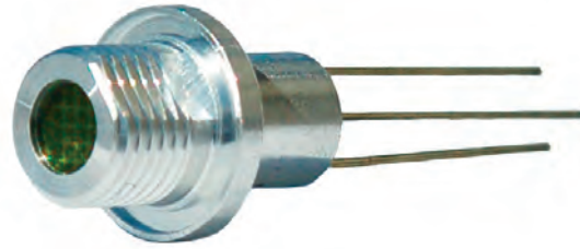
Case with EMI Screen